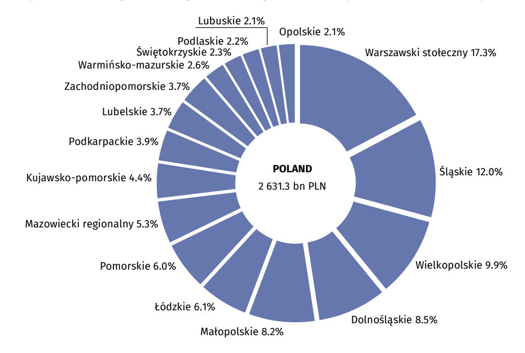
Graph 1. Share of regions in the generation of gross domestic product in 2021 (current prices)

In 2021, all regions recorded an increase in GDP at current prices compared to the previous year